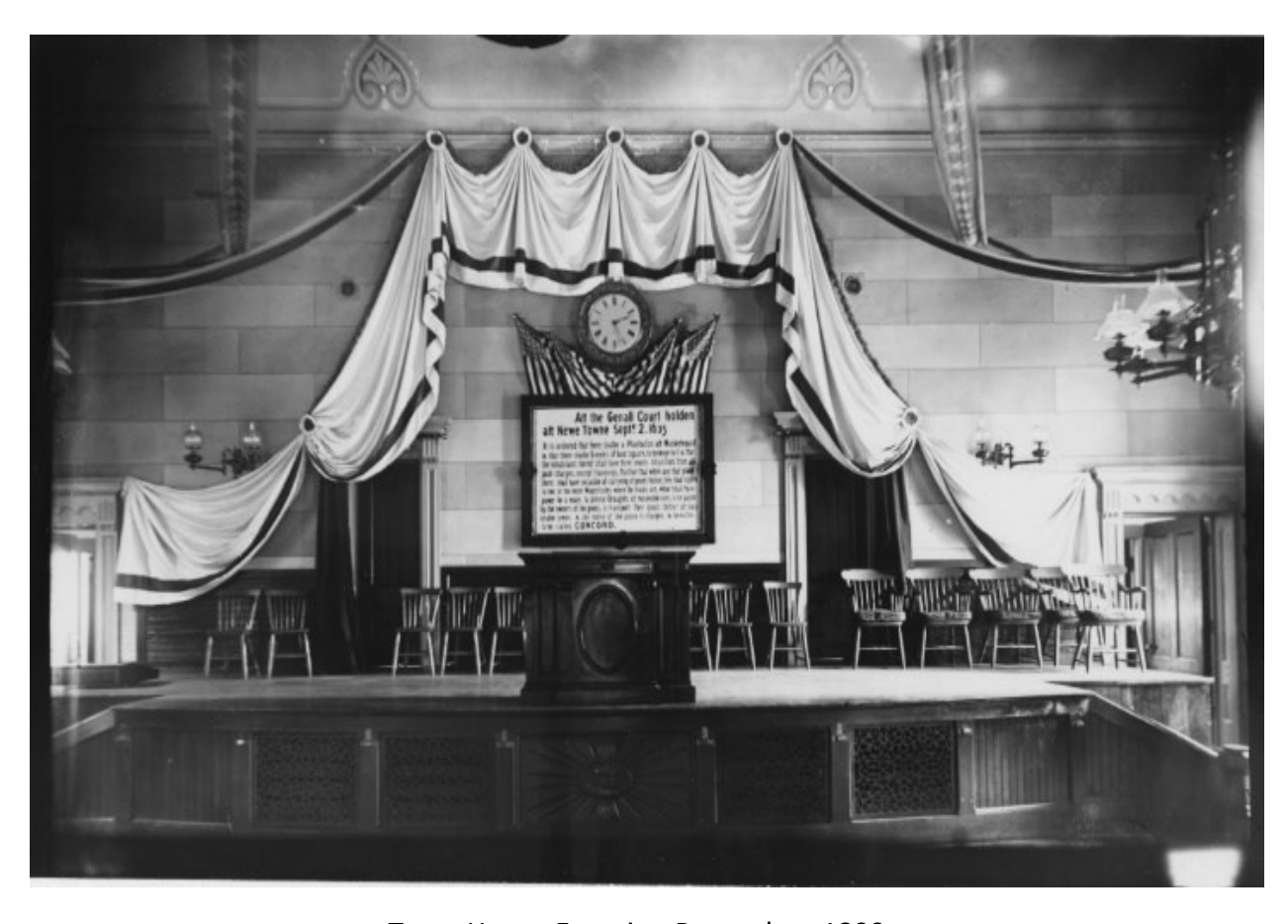
Town House Function Room, late 1800s.